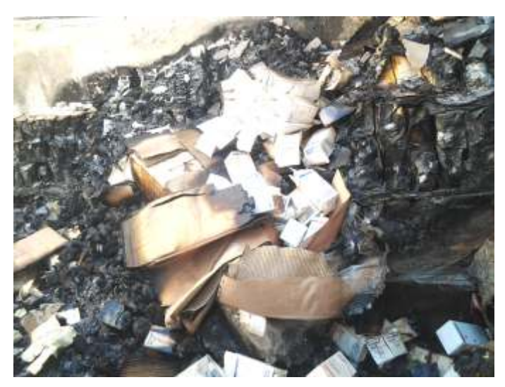
Chidamoyo fire disaster lets do something about it!!!!

Friends & Family lets share the Dream of serving others by introducing LEOs into our clubs. This way we further Service Through Integration in our District 412